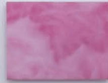
A day's fog (IV, V, VI) oil color on wood, each 40x30cm, 2013