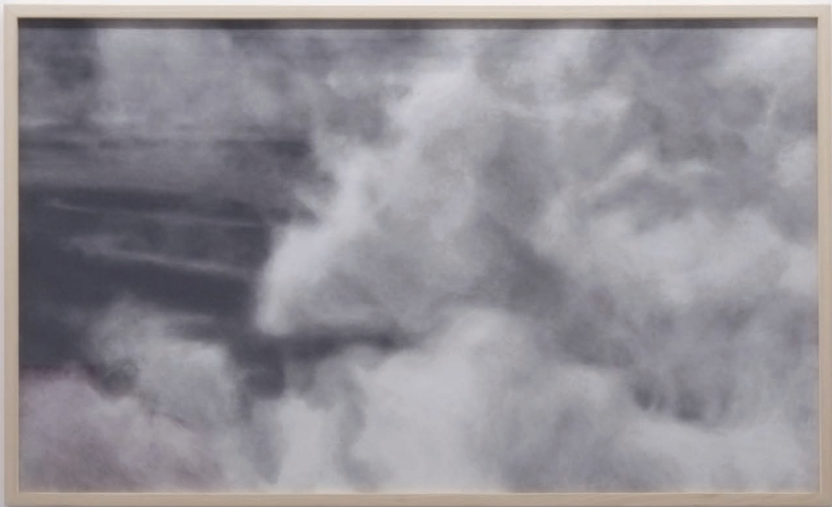
A day's fog (II) pencil on paper, 125x75cm, 2013