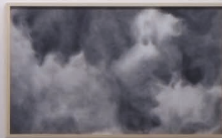
A day's fog (I, II, III) pencil on paper, each 125x75cm, 2013