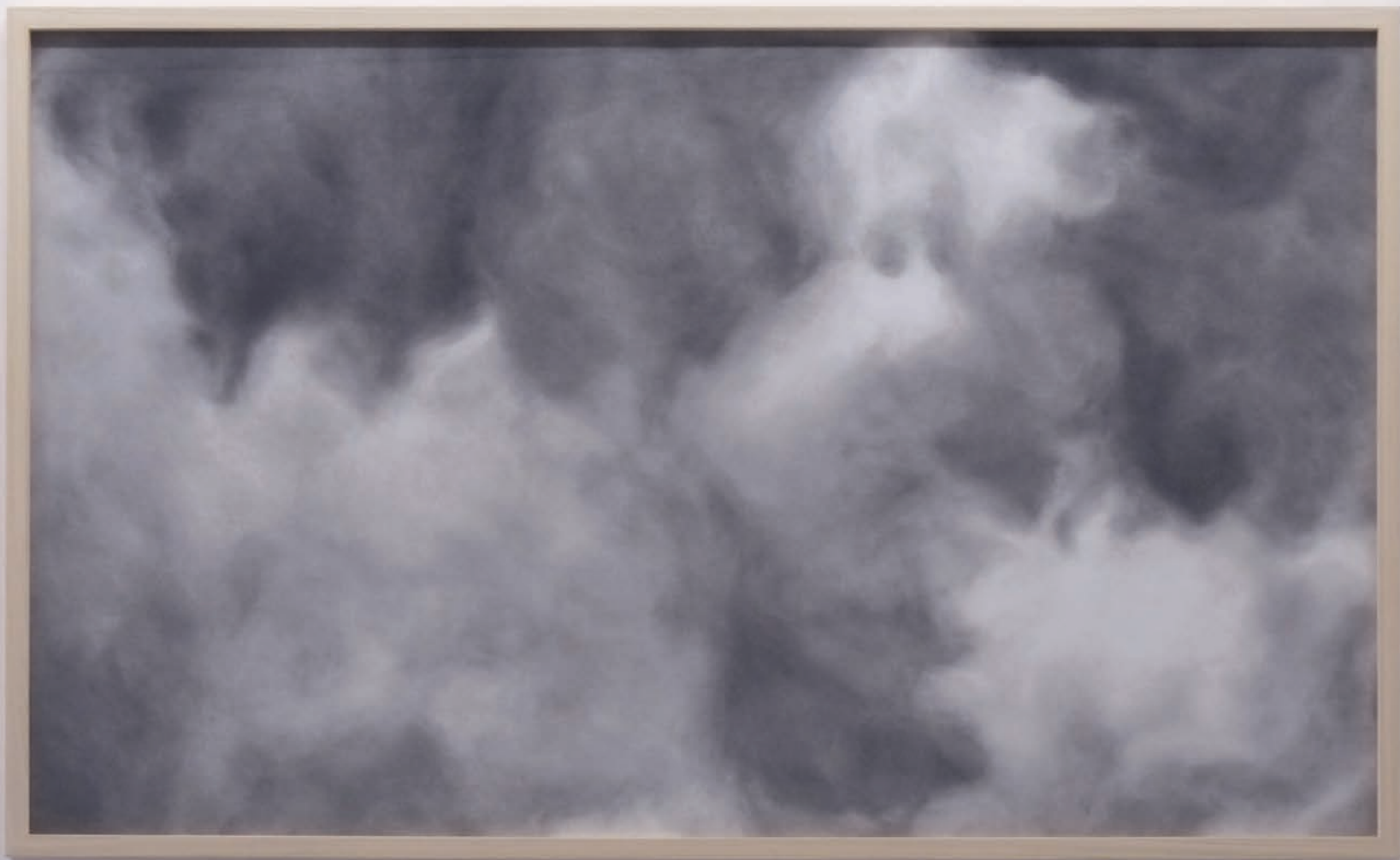
A day's fog (I) pencil on paper, 125x75cm, 2013