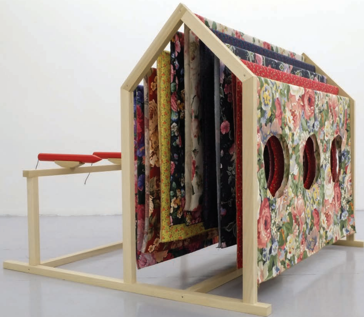
All Comfort wood, textile, fireworks, 130x130x105cm, 2013