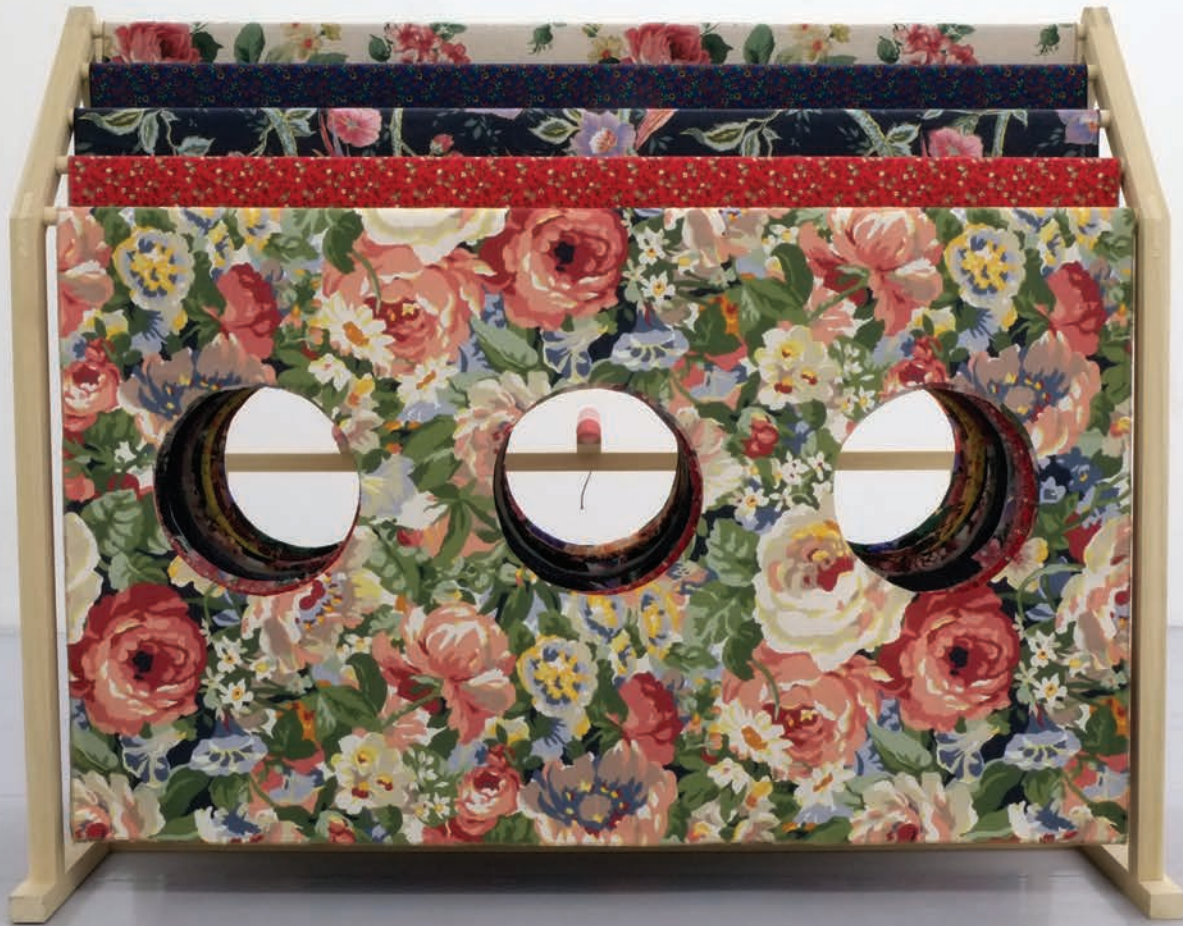
All Comfort wood, textile, fireworks, 130x130x105cm, 2013