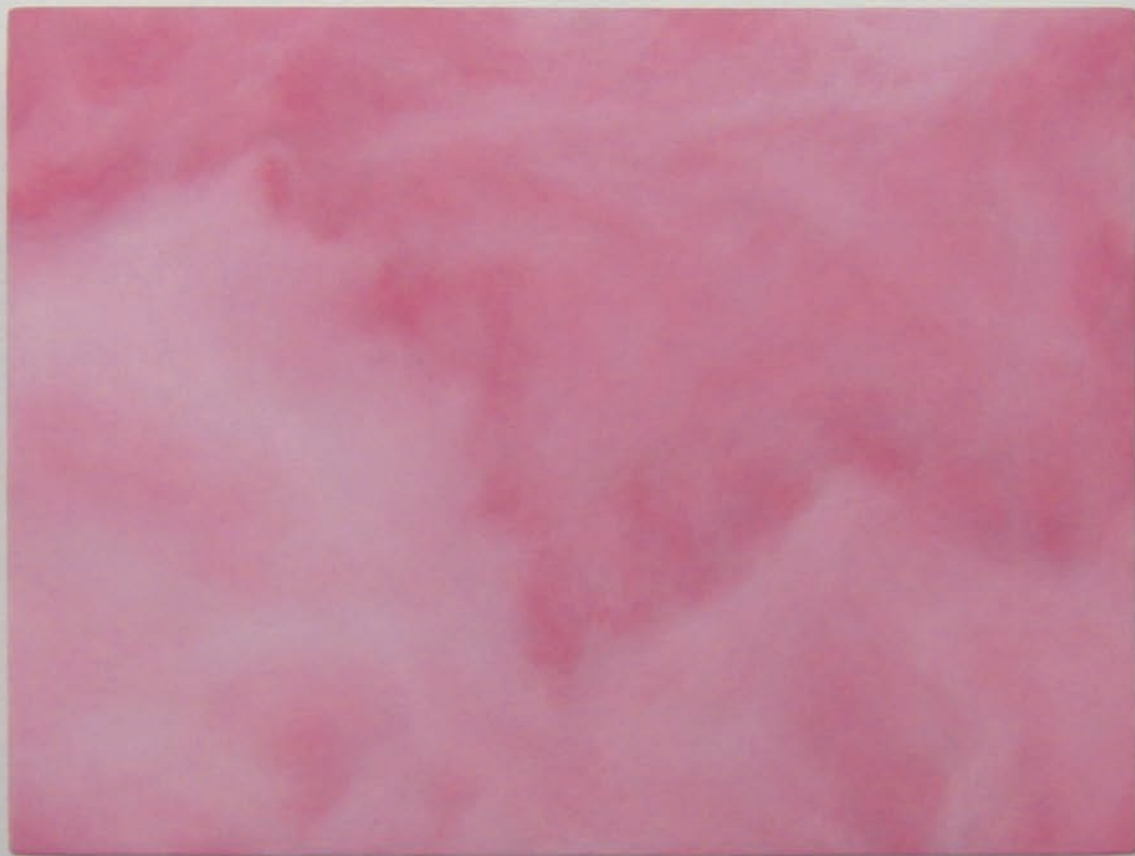
A day's fog (VI) oil color on wood, 40x30cm, 2013