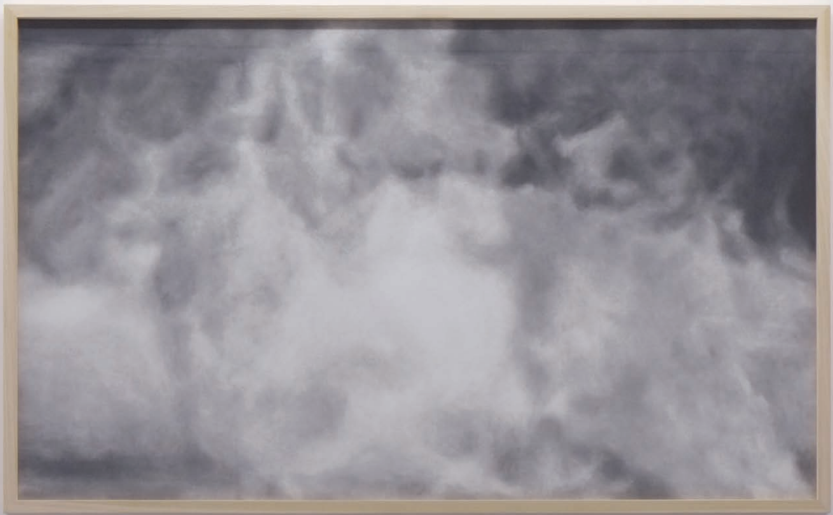
A day's fog (III) pencil on paper, 125x75cm, 2013