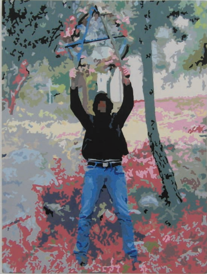
Portrait with Alpha oil color on wood, 30x40cm, 2013