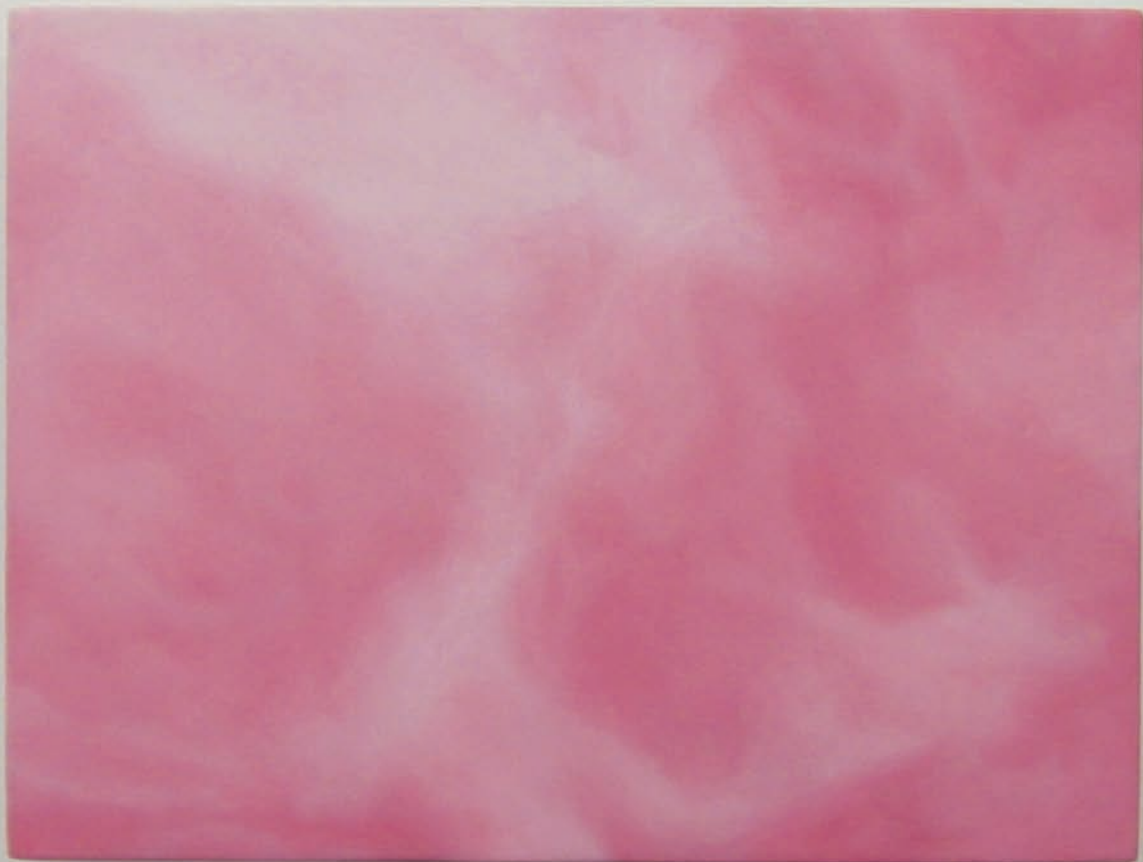
A day's fog (V) oil color on wood, 40x30cm, 2013