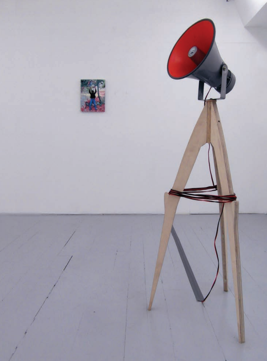
Promising Megaphone wood, megaphone, sound, 2010-2013